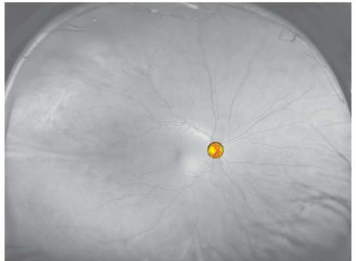
Direct Ophthalmoscope (<10°)