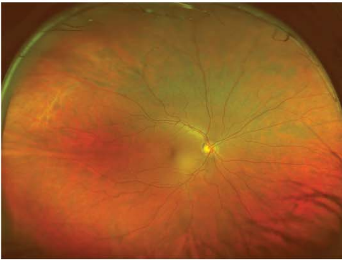
optomap ® Retinal Image (200°)

An optomap ® retinal image compared to conventional devices